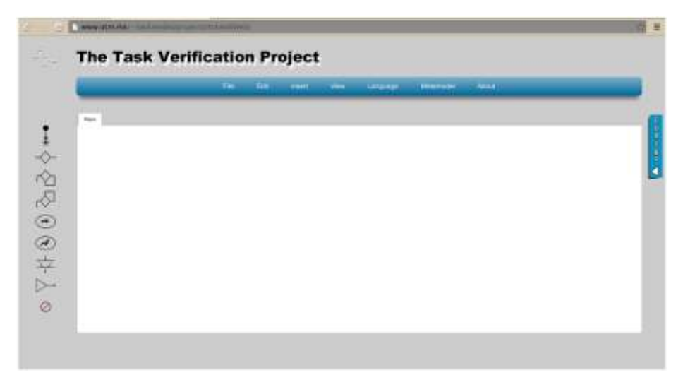
Fig. 2. Low-fidelity prototype presented to the different focus groups [2].